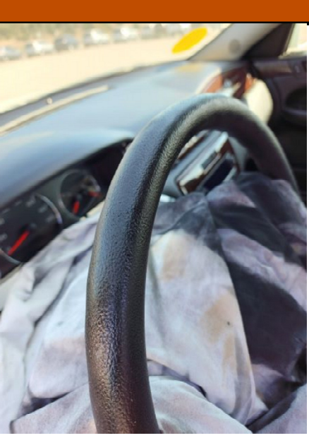
Products Used To Complete Steering Wheel Repair: Acetone, Scrub Pad, Paper Towel, Grain Impression & Heat Gun.